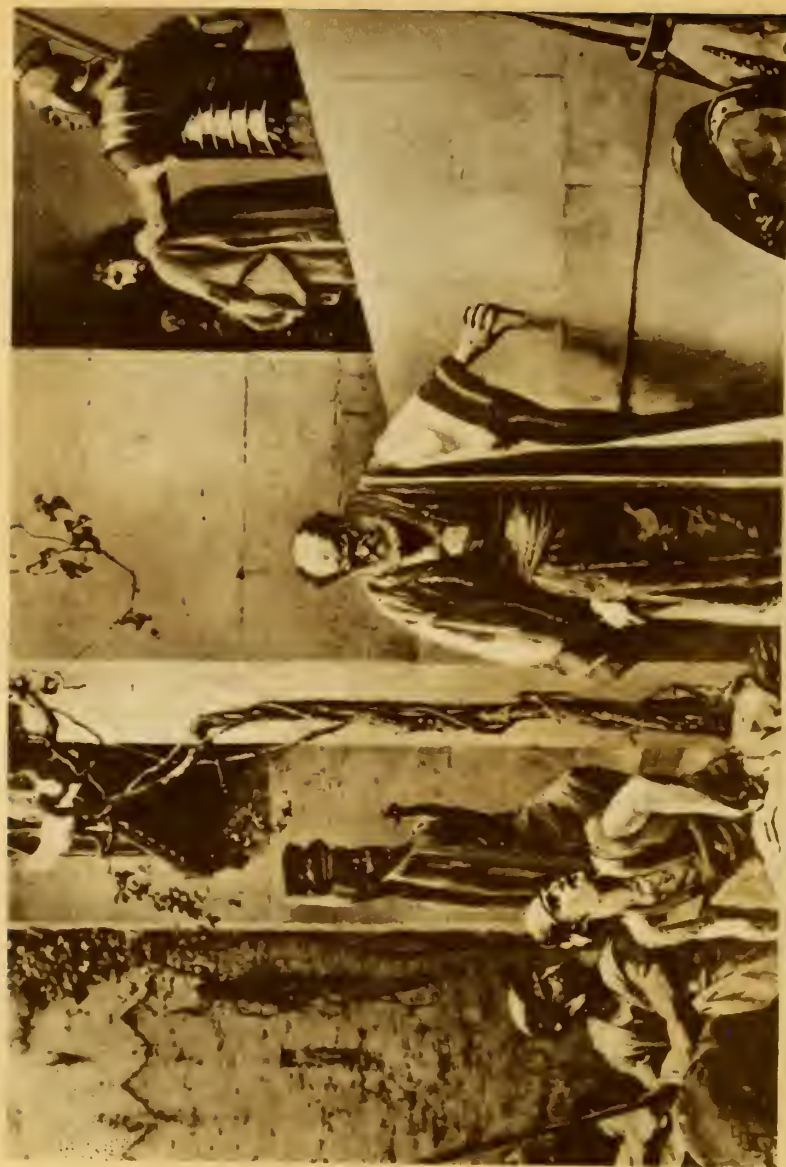
“The Lord turning, looked on Peter; and Peter, going out, wept bitterly.”